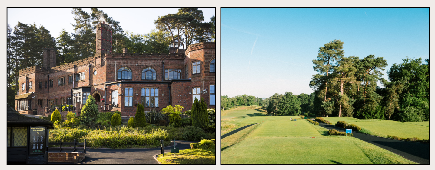
Please note: all FLA events are subject to the application of competition law. Details will be available on the day and are included in the booking form.

All three nines are maintained and groomed to the same high standards and the putting surfaces all play to the same consistent speed.